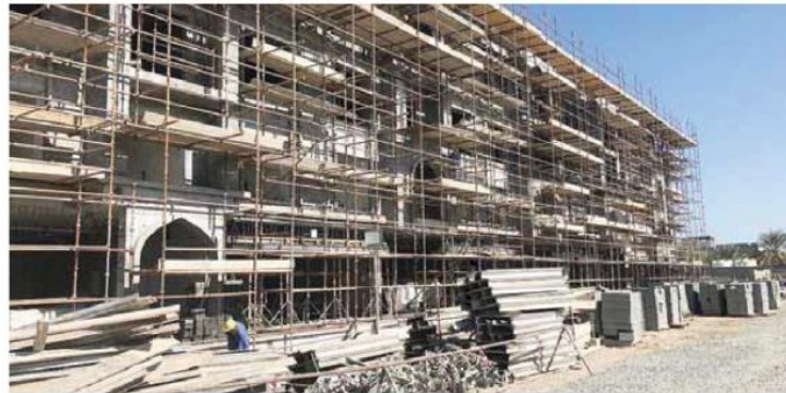
AMENITIES: The Mazaya Residence features several amenities and services, including swimming pools for adults and children, a fully equipped health club, children's play area, round-the-clock CCTV, satellite and internet services, and parking.

Besides this, the foundation laying and other necessary works for the second phase (known as zone